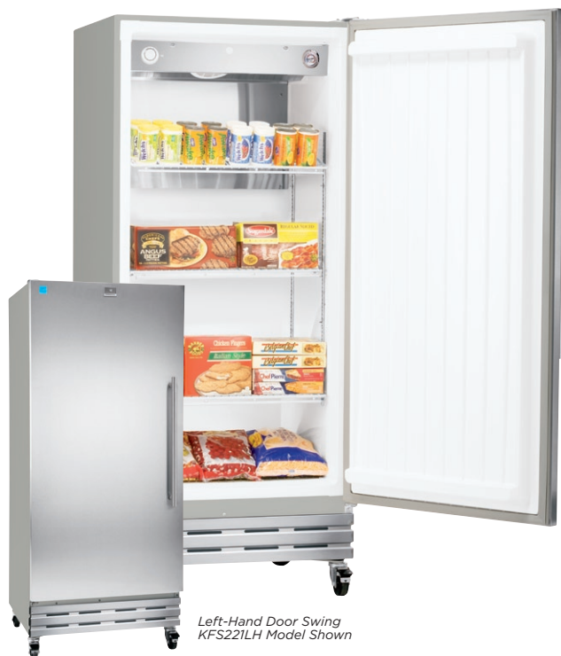
Left-Hand Door Swing KFS221LH Model Shown

19.4 Cu. Ft. Commercial, Food Service Grade